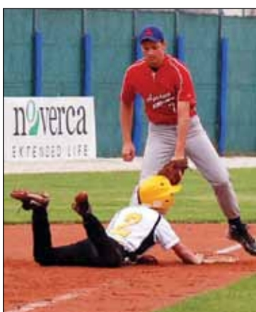
Cougars rout Saints 12-2